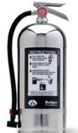
Class K Extinguisher

References: 2007 Oregon Fire Code Chapters 9 and 24